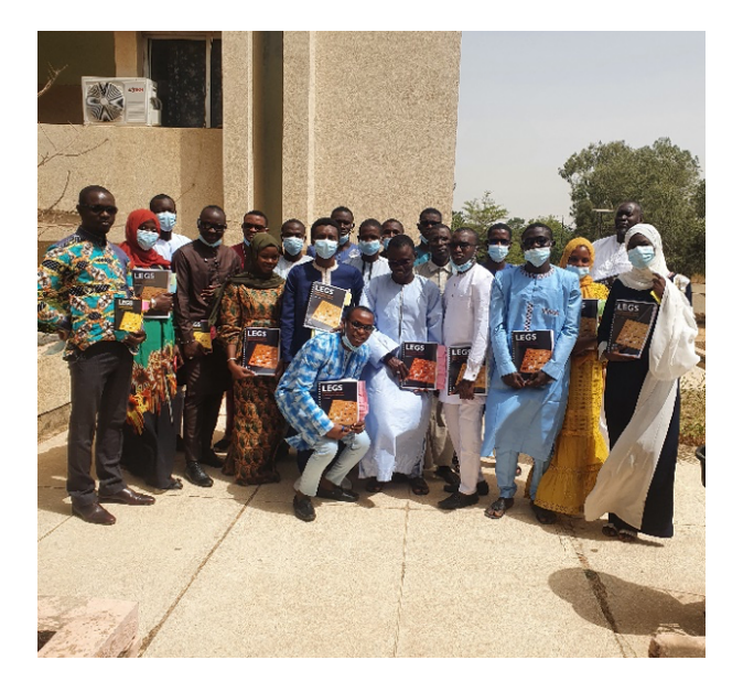
Burkina Faso Training, 2021

The LEGS Handbook was first published in 2009, with a second edition in 2015. The third edition will be published in 2023. LEGS draws on evidence-based good practice from around the world, which is incorporated into the Handbook, training materials and other resources. The LEGS organisation is a non-profit entity registered in the United Kingdom, managed by a Board of Trustees and supported by a small central secretariat. It also has a technical Advisory Group made up of experts from FAO, ICRC, ODI, Sphere India, and Tufts University. For more information, visit livestock-emergency.net .