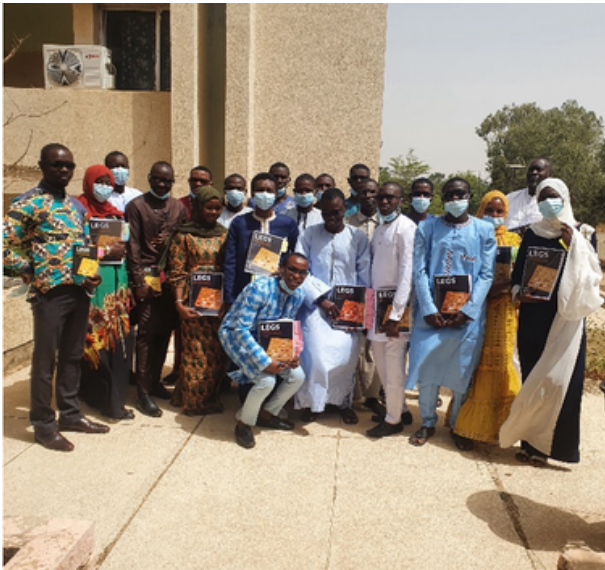
Burkina Faso Training, 2021

The LEGS Handbook was first published in 2009, with a second edition in 2015. The third edition was published in 2023. LEGS draws on evidence-based good practice from around the world, which is incorporated into the Handbook, training materials and other resources. The LEGS organisation is a non-profit entity registered in the United Kingdom, managed by a Board of Trustees and supported by a small central secretariat. It also has a technical Advisory Group made up of experts from FAO, ICRC, ODI, Sphere India, and Tufts University. For more information, visit livestock-emergency.net .