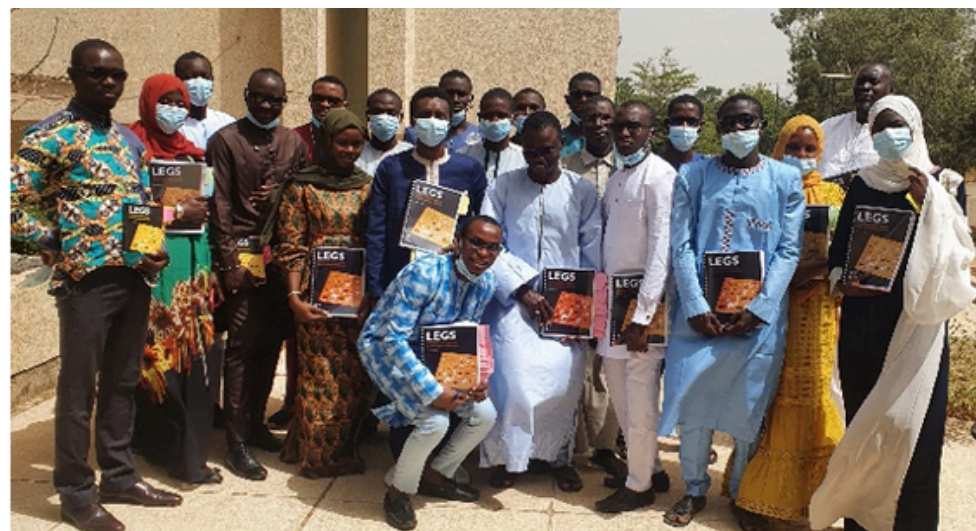
LEGS Core Training Course in Senegal

Supporting livelihoods-based livestock interventions in disasters